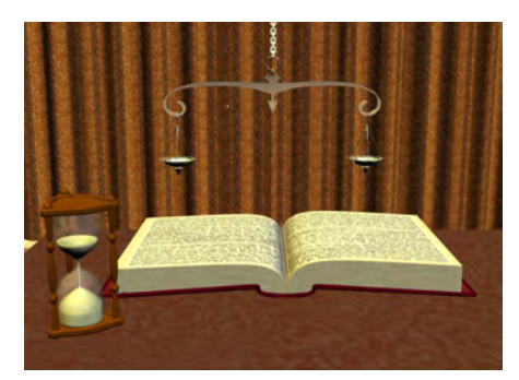
Books were opened and the judgment was set

Notice that NKJV footnote 7:10 has "judgment" instead of "court". KJV does not use "court", but "judgment". RSV uses both court and