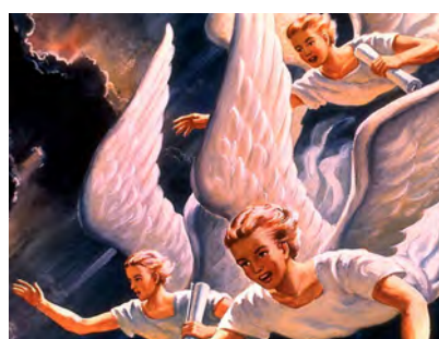
A message of judgment is given to the world before Jesus returns

"Then I saw another angel ... having the everlasting to preach to those that dwell on the earth - to every nation, tribe. tongue, and people - saying ... 'Fear God and give glory to Him,