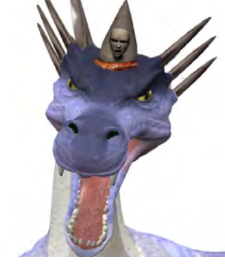
The dominion of the Little Horn is taken away in the judgment

The prophecy of the little horn is pointing, not primarily to the people of the church, but to that power which grasped dominion over the church – over all churches. Even "the saints of the Most High" were "given into his