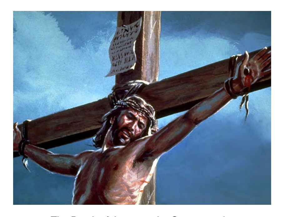
The Death of Jesus on the Cross was the death blow to the kingdom of Satan