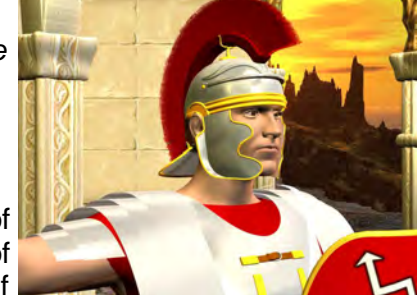
The Romans rose to power after Greece

The literal meaning of "violent men of your people" is "sons of the breakers of your people". The KJV says " robbers of thy people". Three important clues help us to identify these "robbers" or "breakers" as the Romans.