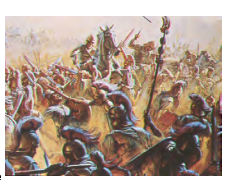
Rome was completely broken apart by the barbarian tribes by AD 476

Daniel 8:25 likewise says of the same power: "He shall be broken without hand."