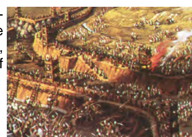
Jerusalem were swept away by Rome. The Temple was totally destroyed, just as Jesus predicted

From here on, we find details of the chapter harder to understand. This is not because there are no events in history that fit the predictions, but because there are so