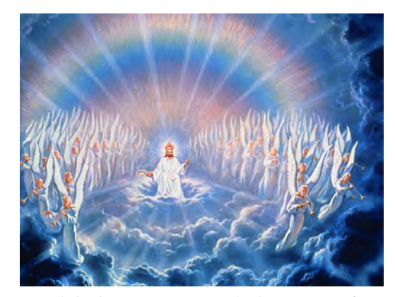
Christ is soon to return, the last verses of Daniel 11 will soon be fulfilled and then the end will come

Do you sense that we are now living in a time of great significance and that our personal decisions for Christ and His word are urgent?