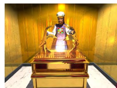
The king of Daniel 11:36-39 is the little horn of Daniel 8 that seeks to counterfeit the work of Christ in the Sanctuary

lence, hunger, homelessness, intolerance, and all evil. But do these prophecies indicate that human effort will ever succeed in bringing in the "one-world" "golden age" of peace?