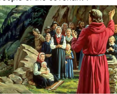
The Waldensians hiding in their mountainous valleys from the tyranny of the Roman church

The Waldenses (northern Italy), the Lollards (England), the Hussites (Bohemia), the Huguenots (France), the Lutherans (Germany), and the Protestants of Spain and the Netherlands were relentlessly persecuted through inquisitions and religious military crusades. "The people of the covenant" went through great suffering for their faith. They had forsaken Rome - sometimes by whole nations - to return to the Gospel covenant.