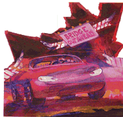
If I ignore God's loving warnings, I will perish.

Answer: The Bible leaves no room for doubt. The answer is sobering and shocking, but true. When a person knowingly rejects light and continues in disobedience, the light eventually goes out, and he is left in total darkness. A person who rejects truth receives a "strong delusion" to believe that falsehood is truth (2 Thessalonians 2:11). When this happens, he is lost from that moment.