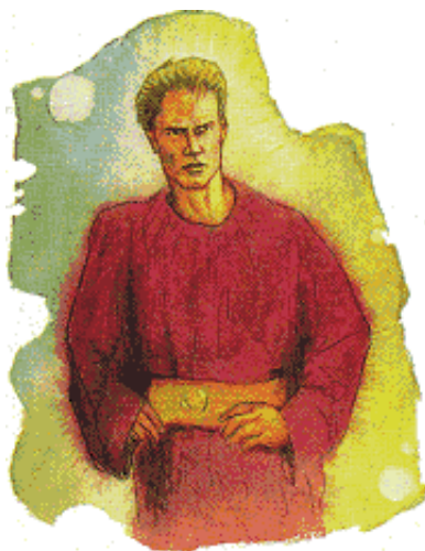
Satan invented the lie that obedience is impossible.

Answer: No, once you are clear on a Bible truth, it is never best to wait. In fact, procrastination is the devil's most dangerous trap. It seems so harmless to wait, but the Bible teaches that unless a person acts immediately upon light, it quickly turns to darkness. Obstacles to obedience are not removed while we stand and wait; instead, they usually increase in size. Man says to God, "Open up the way, and I'll go forward." But God's way is just the opposite. He says, "You go forward, and I will open up the way."